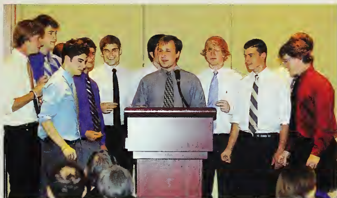
Guests at the Partners' Banquet were entertained by the student musical group, CHI RHO, the Wake Forest University Men's A Cappella Ensemble