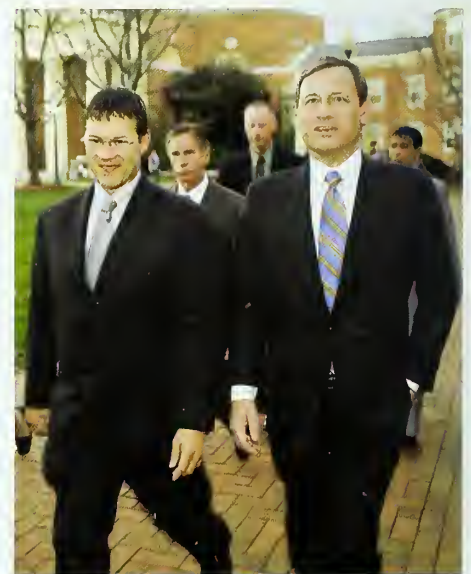
Chief Justice Roberts (right) strolls down the Quad after the Stanley Competition

Justice Ginsburg was originally scheduled to be at Wake Forest on Wednesday, September 7, which turned out to be the day of Chief Justice Rehnquist's funeral. She asked me to call her at home on Labor Day weekend and within hours had rescheduled her visit for three weeks later, redoing her hectic schedule so she would not disappoint our law school community.